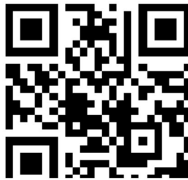
Five Star's Elf the Musical, Jr Audition Sign Ups 2025

PLEASE ARRIVE 30 minutes prior to your audition time for check-in.